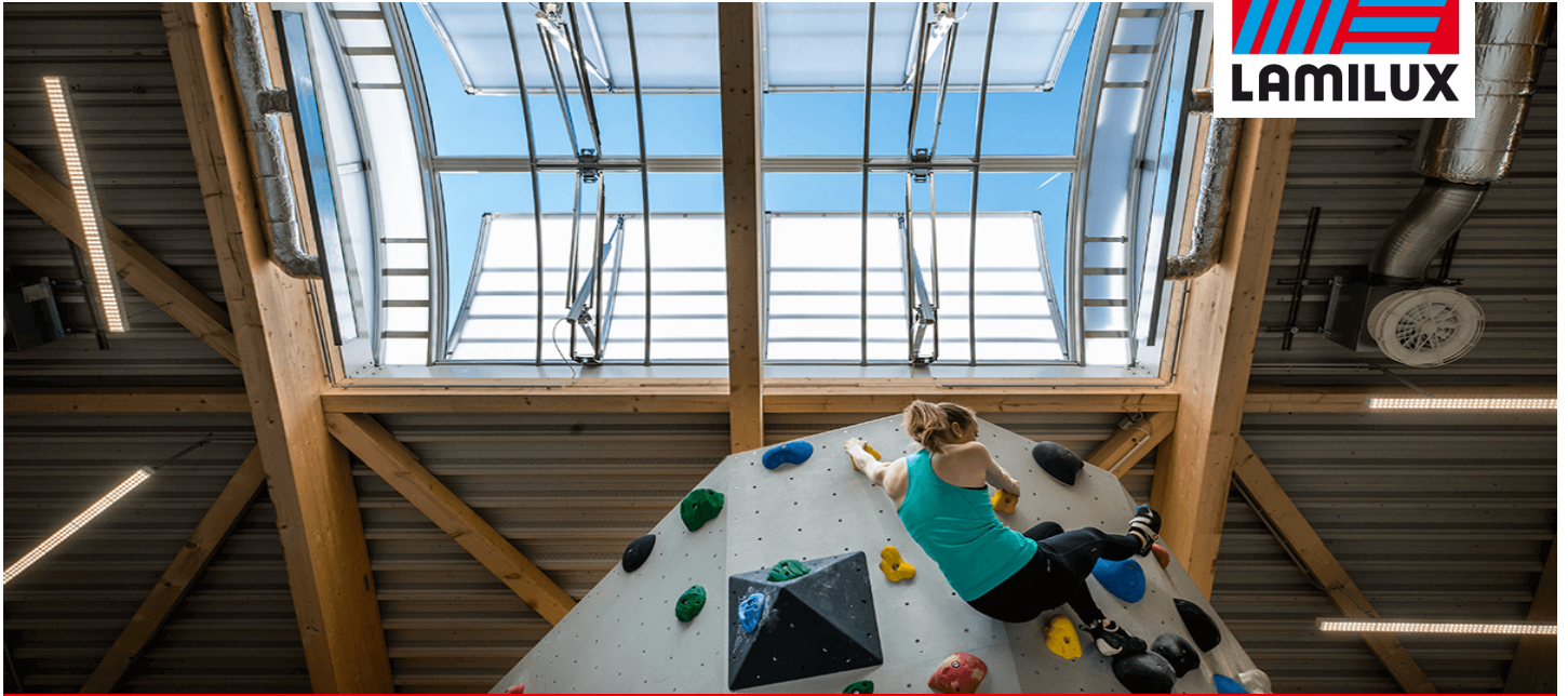
Climbing Centre OWL, Brakel