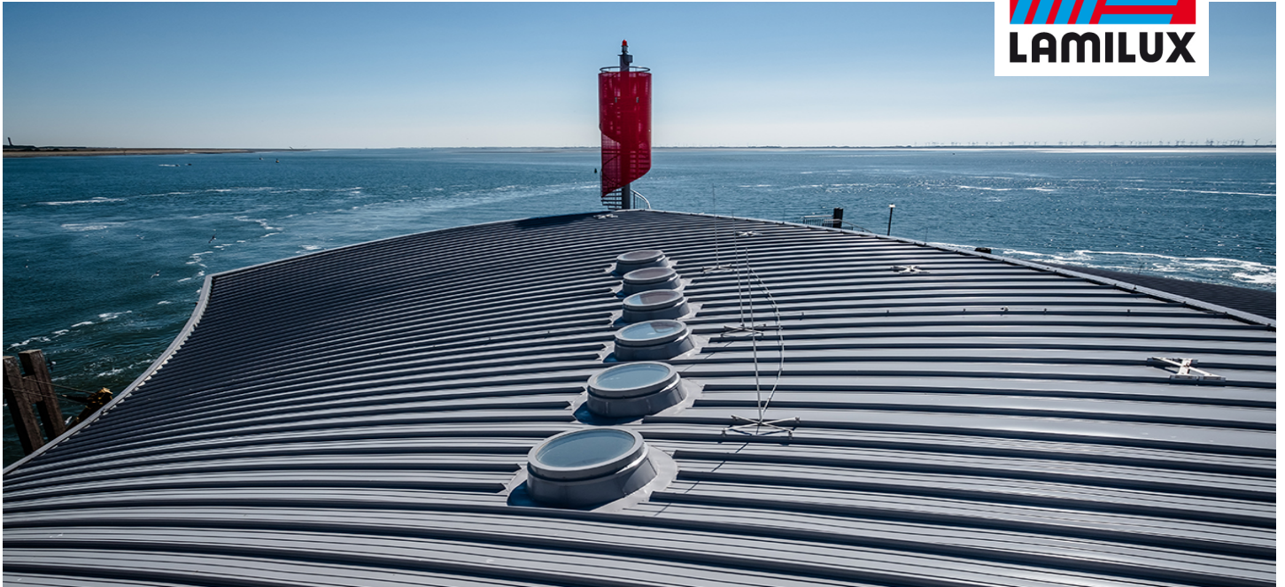
Harbour Terminal "Hafendüne", Norderney (Germany)