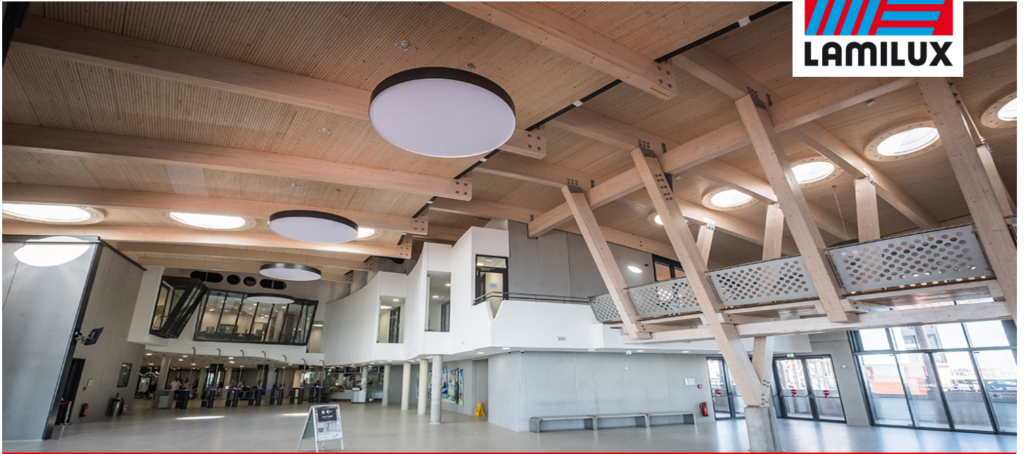
Harbour Terminal "Hafendüne", Norderney (Germany)